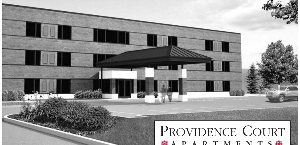
PROVIDENCE COURT APARTMENTS

The new model of assisted care is an exciting change for St. Anne's, and offers a specialized living option for residents featuring forty-eight studio apartments on three floors, each with a